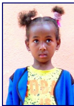
Siharm Female 6 yrs