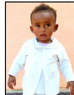
Frezer Male 3 yrs